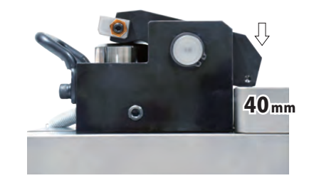
Mold Back-Plate Thickness: 40mm When the back-plate is 10mm lower, the mold can be clamped by the long stroke function.