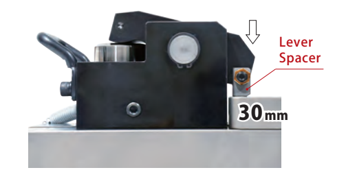
Mold Back-Plate Thickness: 30mm When the back-plate is 20mm lower, the mold can be clamped by setting the lever spacer.